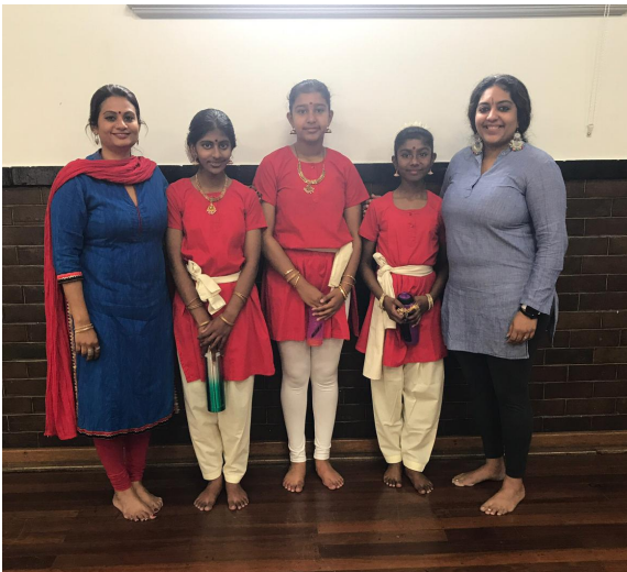
Stage 1 & 2 Students from Kilburn Hall