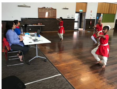
Examination in progress at Kilburn Hall