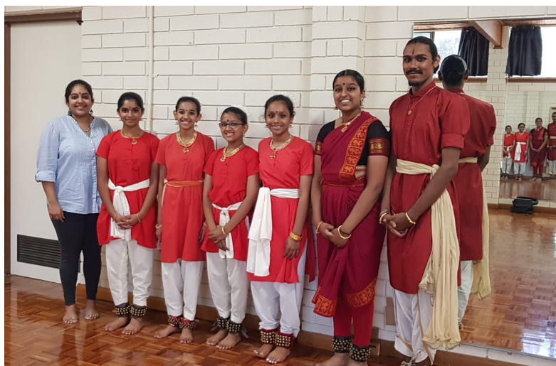
Stage 3 Students from Cosgrove Hall