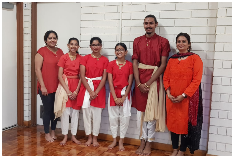
Stage 1 & Stage 2 Students from Cosgrove Hall