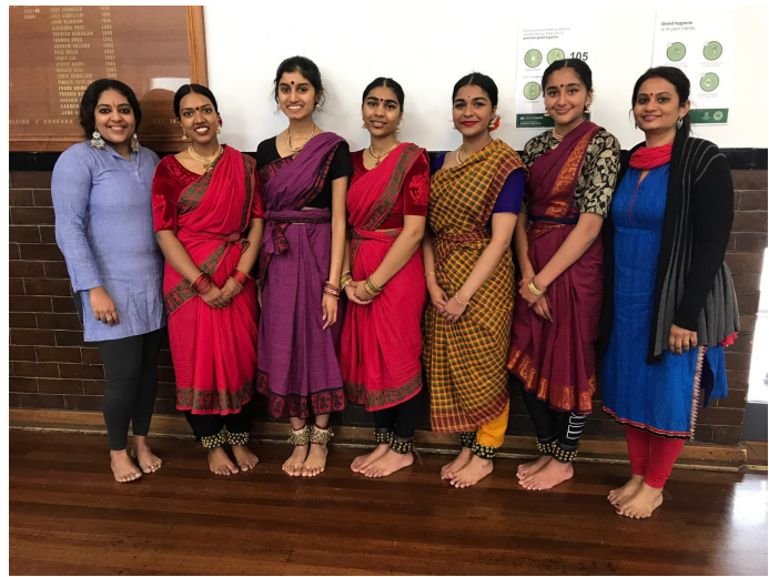
Stage 3 Students from Kilburn Hall